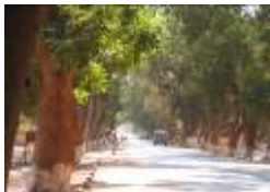
TREE-LINED AVENUE W/ SIDEWALK & PLANTING STRIP