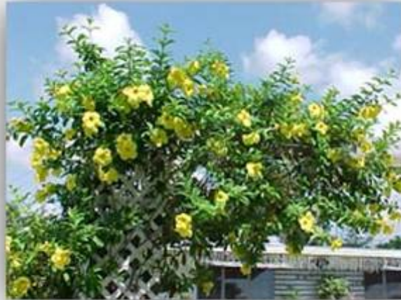
Allamanda cathartica (YELLOWBELL VINE)