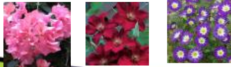
FLOWERING VINES FOR PLANTERS & GROUNDCOVER