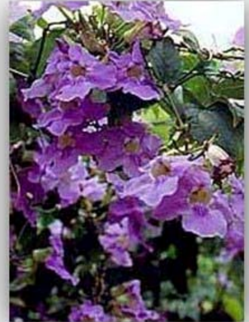
Thunbergia grandiflora (SKYFLOWER VINE)

THE DESIGN INTENT IS TO HAVE LUSH & COLORFUL LANDSCAPING THROUGH THE FLOWERS AND VINES ON THE BUILDING FAÇADE AND ITS PLANTING STRIP, AND IN THE THEMED GARDENS & POCKET PARKS.