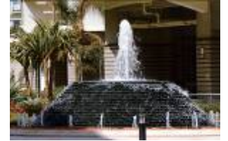
CIRCULAR WATER FEATURE AT THE ROAD'S END

1 Development resembles a CURVILINEAR PARK