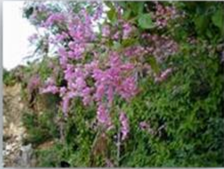
Bougainvillea sp. (BOUGAINVILLEA GUAM)