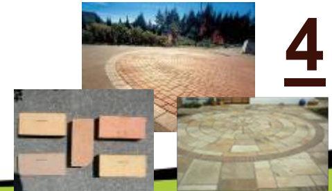
SPECIAL PAVING AT STREET CORNER/ BEND