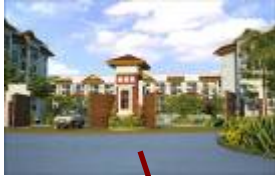
IMPRESSIVE ENTRANCE GATE

1 Development resembles a CURVILINEAR PARK